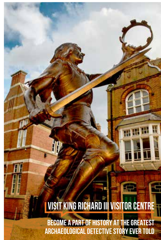
VISIT KING RICHARD III VISITOR CENTRE

BECOME A PART OF HISTORY AT THE GREATEST ARCHAEOLOGICAL DETECTIVE STORY EVER TOLD