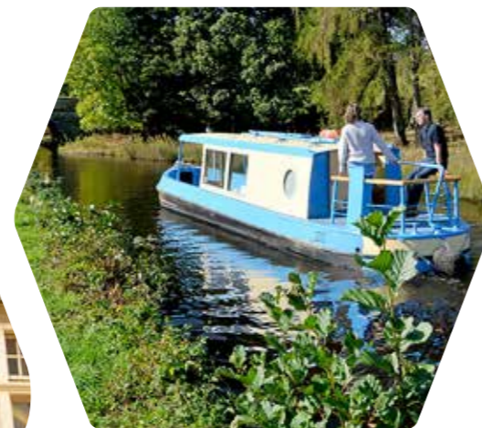
Leicestershire – Experiences