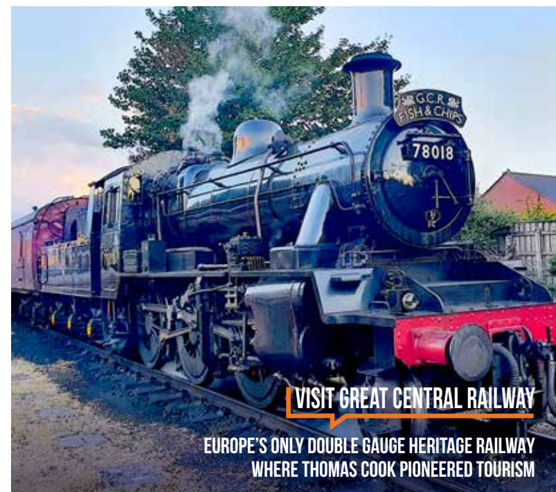
VISIT GREAT CENTRAL RAILWAY

DISCOVER THE UNIVERSE AT THE UK'S LARGEST PLANETARIUM AND BE STARSTRUCK BY 42M HIGH ROCKET TOWER