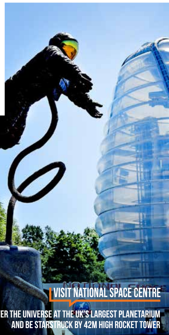
VISIT NATIONAL SPACE CENTRE

DISCOVER THE UNIVERSE AT THE UK'S LARGEST PLANETARIUM AND BE STARSTRUCK BY 42M HIGH ROCKET TOWER