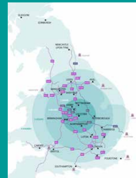
Leicestershire – Experiences