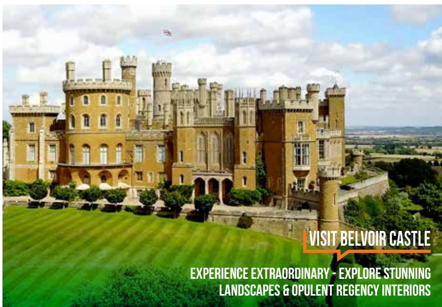
VISIT BELVOIR CASTLE

BECOME A PART OF HISTORY AT THE GREATEST ARCHAEOLOGICAL DETECTIVE STORY EVER TOLD